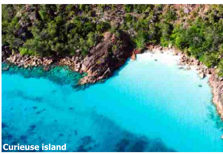
Day 3 - Monday