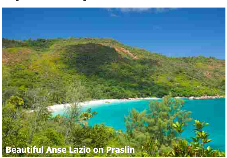
Day 6 - Thursday

Sail to Praslin, Seychelles' second-largest inhabited island, for Sail towards Cousin island off the coast of Praslin, for a Sail to Anse Lazio, one of the most beautiful beaches in Praslin, the world's only granitic ocean islands one last evening.