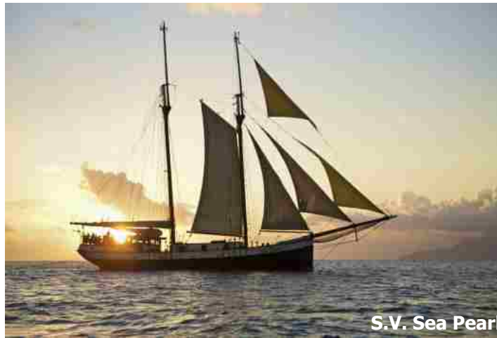
S.V. Sea Pearl

Disembarkation at the Inter-Island Quay at 08.30hrs.