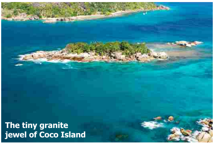
The tiny granite jewel of Coco Island

In the morning the vessel sails toward Grande Soeur and Petite Soeur (the Sisters) for excellent snorkelling and diving, and for a relaxing visit of these unique and completely uninhabited tropical islands. In the afternoon, visit Coco Island, one of Seychelles' tiny granite jewels, a fantastic spot for snorkelling within a kaleidoscope of tropical fish.