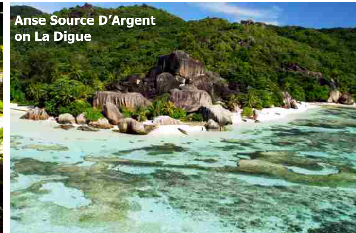
Anse Source D'Argent on La Digue

A morning sail brings the vessel to La Digue, a sleepy island community where ox-carts and bicycles still remain the most common mode of transportation throughout the island. La Digue is home to the endemic Seychelles Paradise Flycatcher, and is perhaps most famous for its massive granite boulder formations at Anse Source d'Argent, which is thought to be the most photographed beach on earth. Explore the entire island by bicycle, perhaps stopping by Union Estate, a sprawling network of traditional island activities, including a copra mill, vanilla plantation, and shipyard.