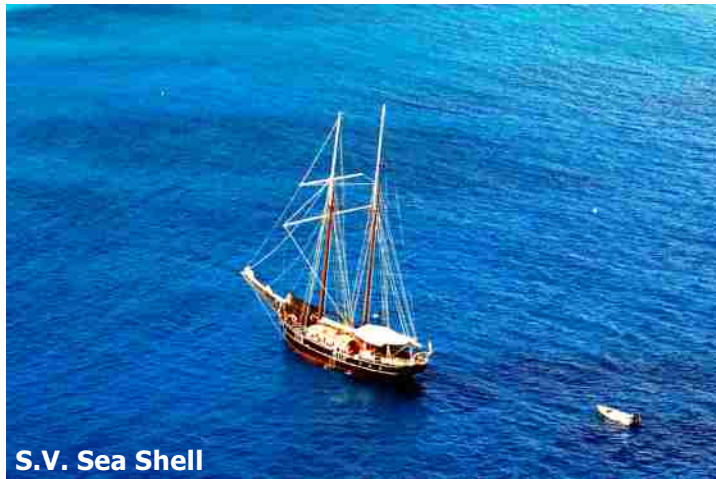
S.V. Sea Shell

Embarkation at the Inter-Island Quay at 1030hrs, followed by the Captain's welcome briefing. Depart Port Victoria at 1200hrs, sailing from Mahé to a late afternoon anchorage at Round Island, just off the isle of Praslin. In the evening, introduce yourself to Creole cuisine with a welcome barbecue dinner onboard.