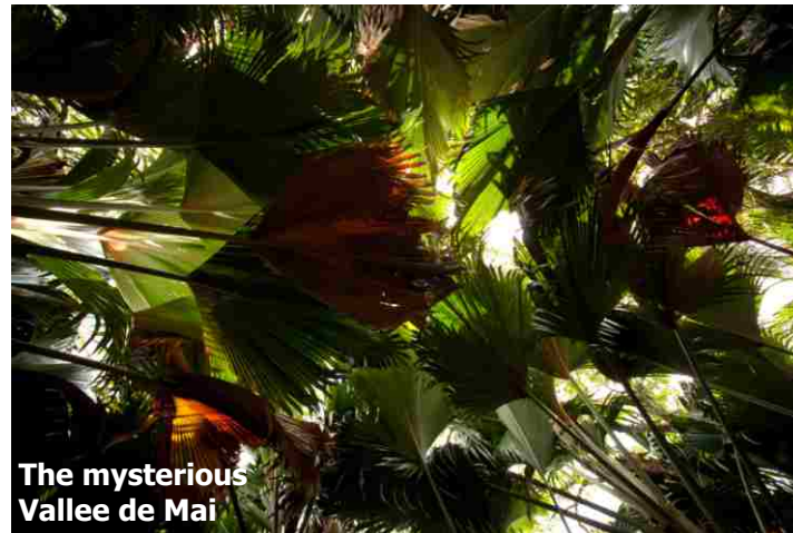
The mysterious Vallee de Mai

Sail to Praslin, Seychelles' second-largest inhabited island, for disembarkation to the famous World Heritage Site, the Vallee de Mai Nature Reserve. This ancient forest is home to the curiously shaped double coconut, the coco de mer, as well as the Black Parrot, unique to Praslin. Explore the valley's eerie pathways beneath its canopy of massive palms, before returning onboard for afternoon opportunities to dive, snorkel or enjoy other water sports.