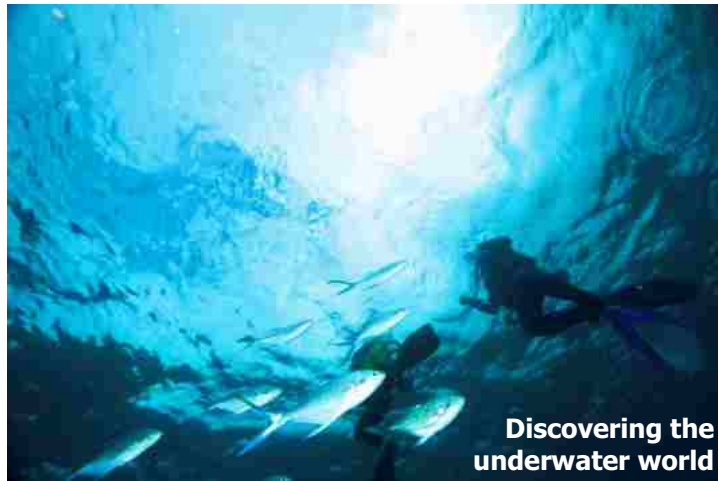
Discovering the underwater world

After breakfast, enjoy a leisurely sail back towards Mahé, with a last stop at Ile Seche for more snorkelling or diving, followed by a farewell barbecue. The vessel then sails into Port Victoria for an overnight stay.