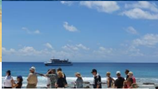
Deck Plan M/S PANORAMA II

Discover the Seychelles the best way: By small ship. Hop from island to island in perfect harmony with this unspoiled paradise and visit islands which will capture your senses. Everywhere an amazing fauna and flora; Snorkel or dive and watch an amazing underwater world. Walk into centuries old rain forests with unique species of wild life and sight the rare black parrots, the world famous Coco de Mer palm trees or giant land tortoises.